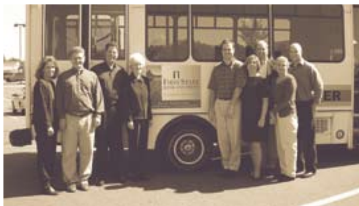
We appreciate the generosity of our 2007 sponsors.